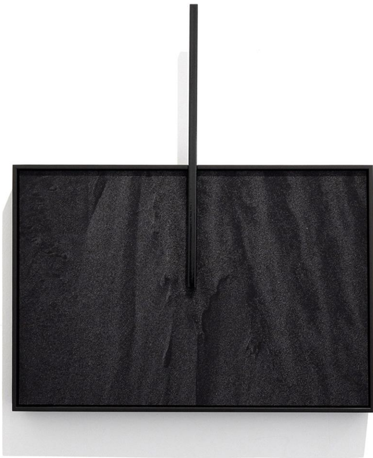
Fabian Albertini black vertical line 2021 / 2021 Fine art print on photo rag, powder coated steel Wooden frame 50 x 50 x 3 cm 1/1 (+ 1 AP) 3.300 €