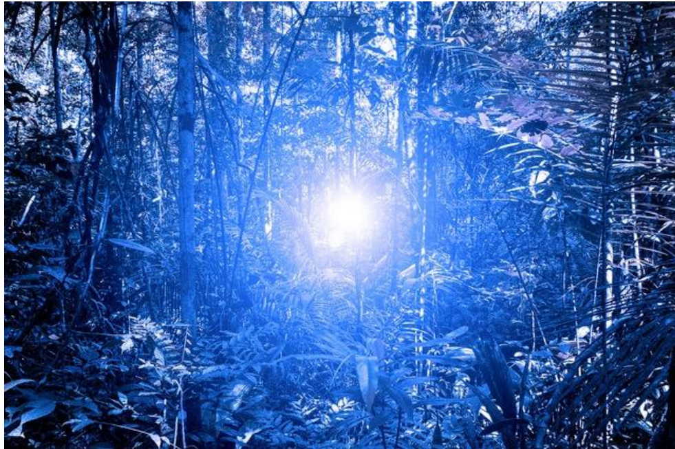
Fabian Albertini We are all made of light 2018 / 2018 Archival pigmented print Blue frame with museum glass 100 x 150cm 1/1 (+ 1 AP) 8.500 €