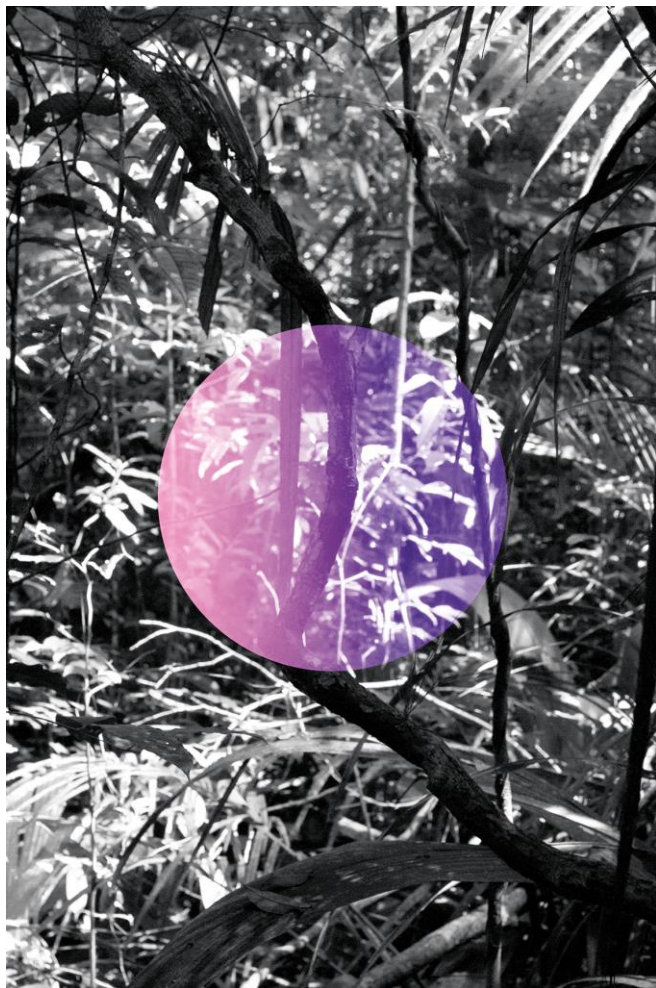
Fabian Albertini layer of amazon 2024 / 2024 Fine art print on photo rag Iron frame 18 x 24 x 6 cm 1/3 (+ 1 AP) 1.500 €